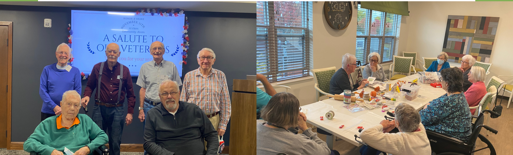
Thank you to all of our Seven Hills Veterans!

A Monthly Newsletter for Seven Hills Senior Living